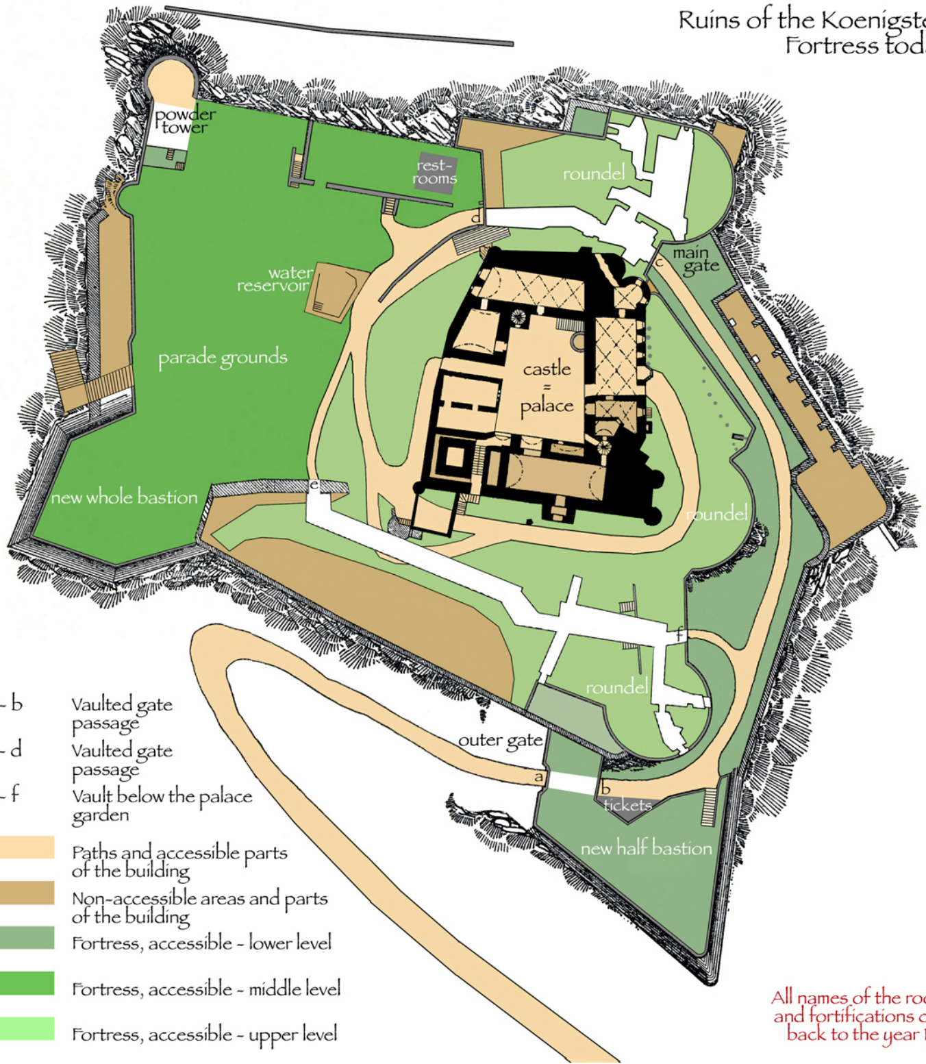
Ruins of the Koenigstein Fortress today