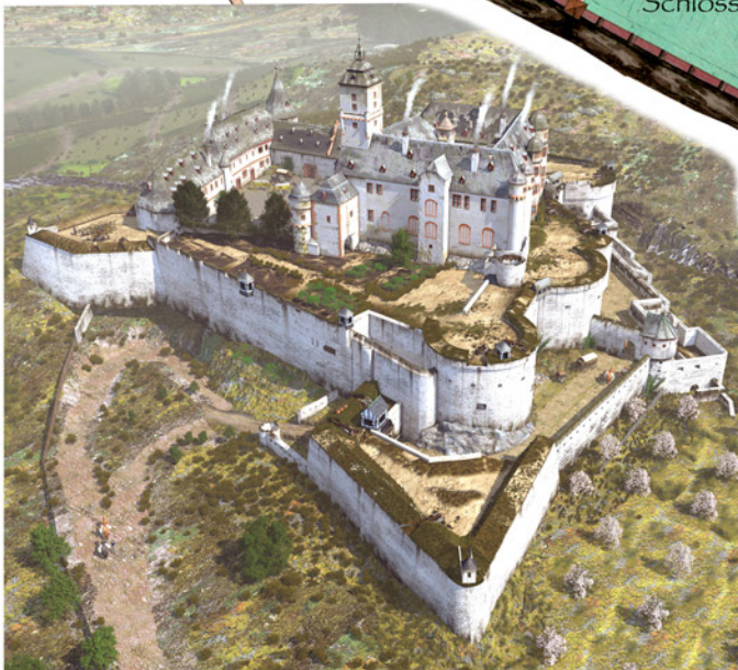
Digital reconstruction: The fortress 1795 seen from the west.